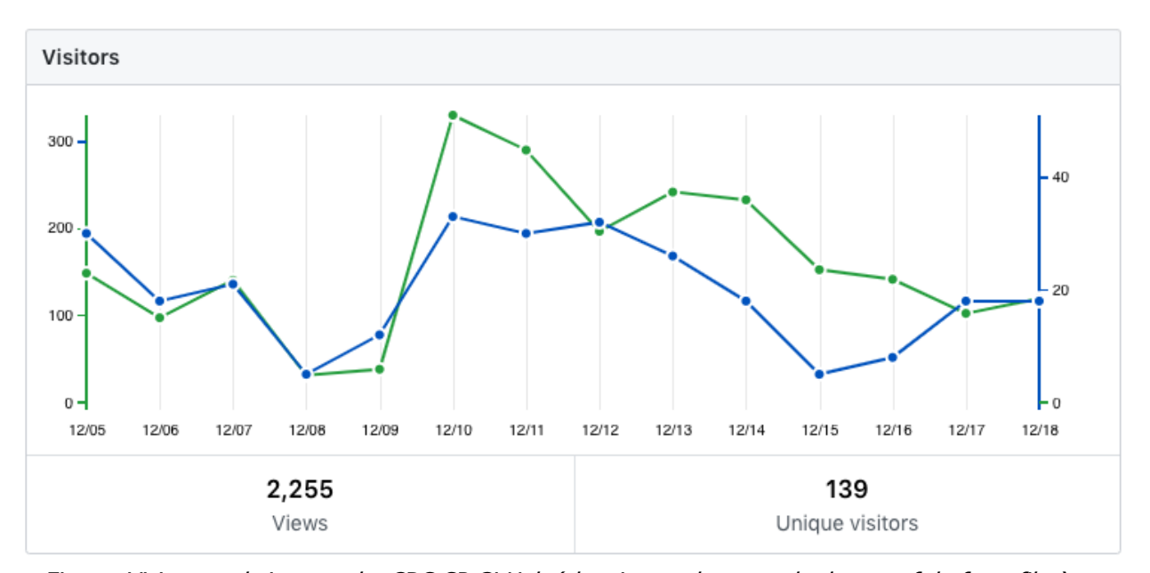
Figure: Visitors and views to the CDS-SP GitHub (showing peaks around releases of draft profiles)

From an activity perspective the majority of feedback and discussion originated with a very small number of individuals (3) and organisations (2).